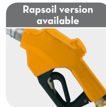
Rapsoil version available