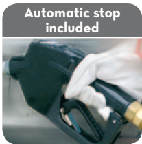
Automatic stop included