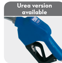
Urea version available