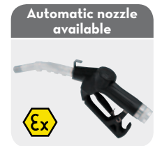
Automatic nozzle available