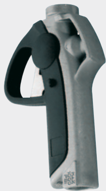
EASY OIL nozzle