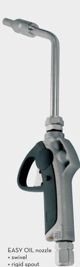
EASY OIL nozzle + swivel + rigid spout