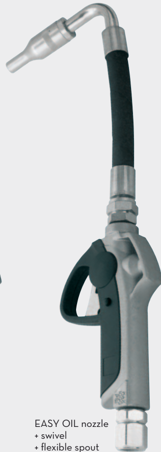
EASY OIL nozzle + swivel + flexible spout