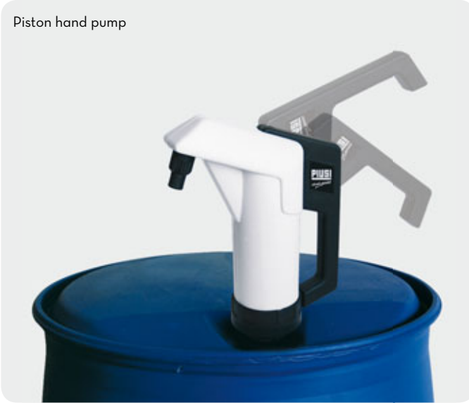
Piston hand pump