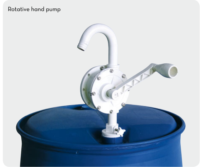
Rotative hand pump