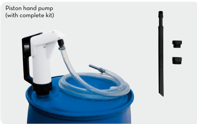
Piston hand pump (with complete kit)