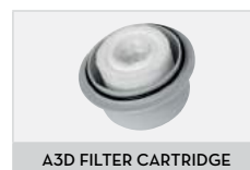
A3D FILTER CARTRIDGE