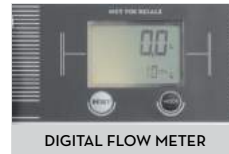
DIGITAL FLOW METER