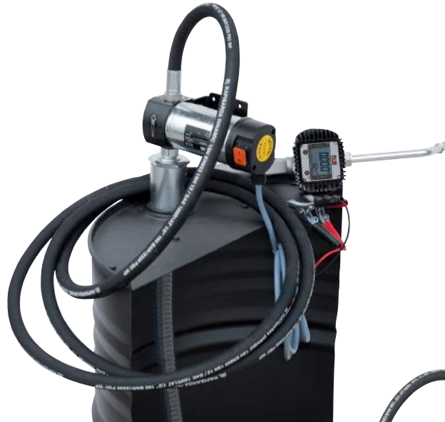
DRUM VISCOMAT GEAR DC