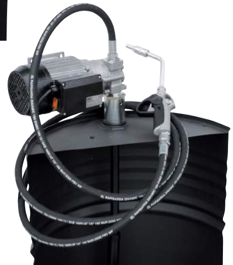
DRUM VISCOMAT GEAR AC