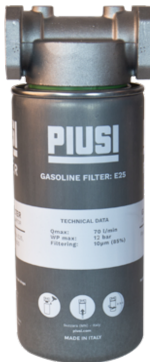
GASOLINE FILTER E25 WITH FILTER HEAD