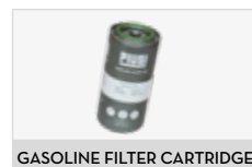
GASOLINE FILTER CARTRIDGE