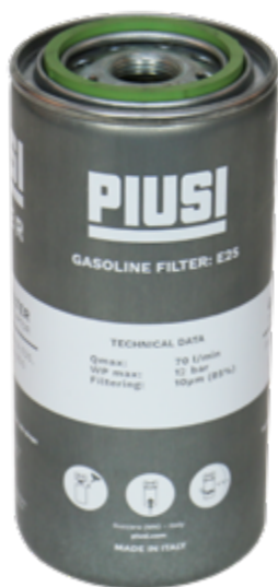
CARTRIDGE GASOLINE FILTER E25