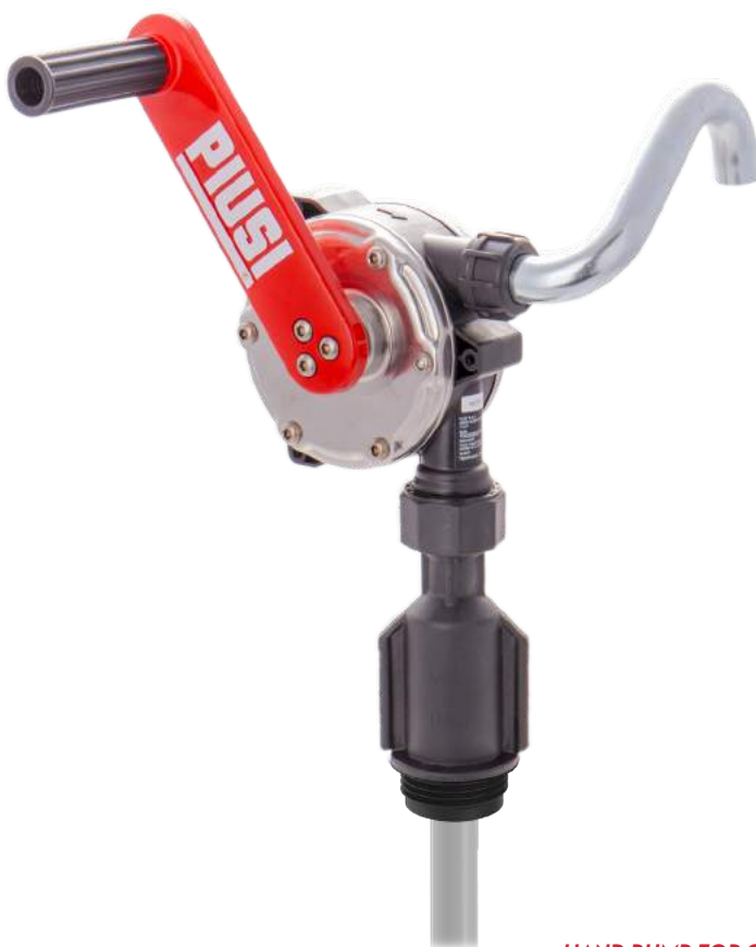
HAND PUMP FOR OIL-DIESEL