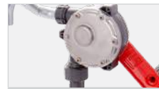
HIGH QUALITY MATERIALS