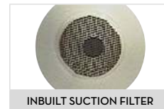
INBUILT SUCTION FILTER