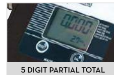
5 DIGIT PARTIAL TOTAL