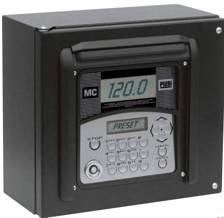
MC BOX 2.0