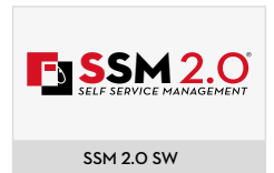
SSM 2.0 SW