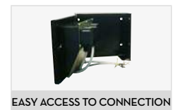
EASY ACCESS TO CONNECTION