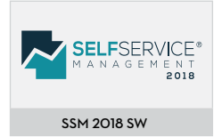
SSM 2018 SW