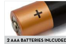
2 AAA BATTERIES INCLUDED