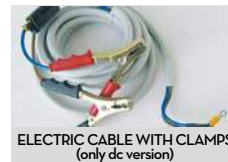
ELECTRIC CABLE WITH CLAMPS (only dc version)