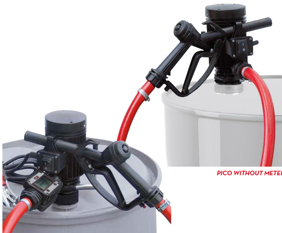
PICO WITHOUT METER