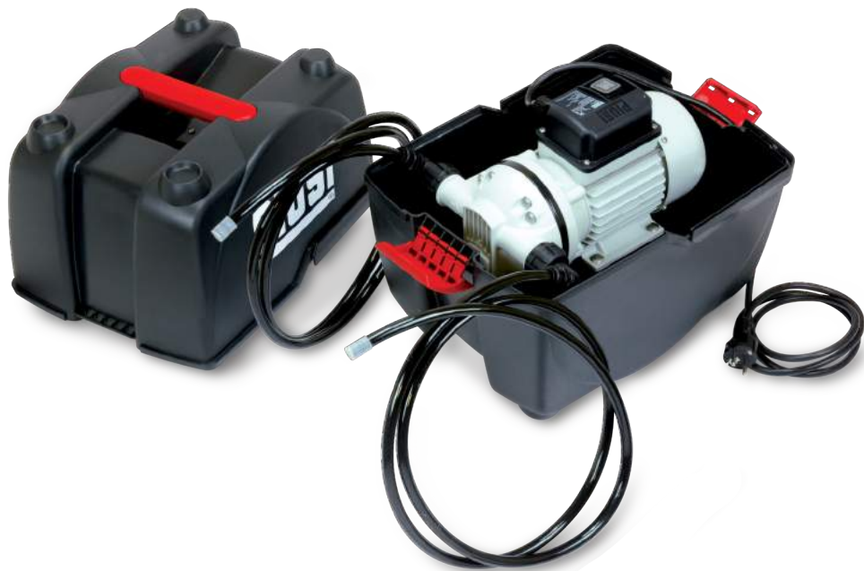
PIUSIBOX CAR SUCTION