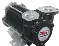
DC PUMP - BP3000