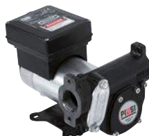
DC PUMP - PANTHER DC