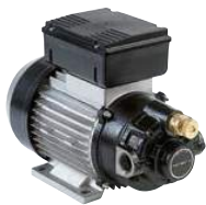
AC PUMP - VISCOMAT VANE