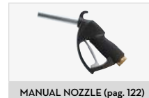
MANUAL NOZZLE (pag. 122)