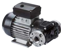
AC PUMP - E120