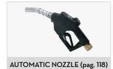
AUTOMATIC NOZZLE (pag. 118)