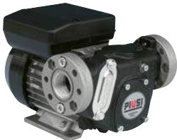
AC PUMP - PANTHER