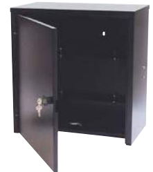
METALLIC BOX (optional)