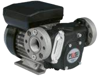
AC PUMP - PANTHER 56/72