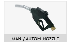
MAN. / AUTOM. NOZZLE