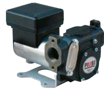
DC PUMP - PANTHER DC