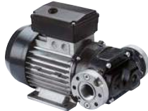
AC PUMP - E80/E120