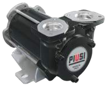
DC PUMP - BYPASS 3000