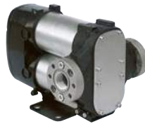
DC PUMP - BIPUMP