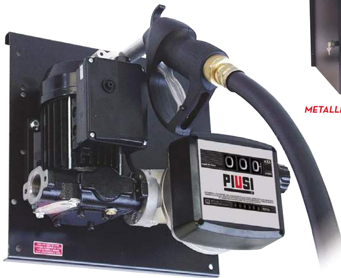
ST WITH METER