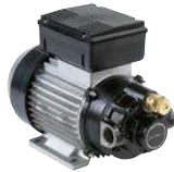
AC PUMP - VISCOMAT 70/90