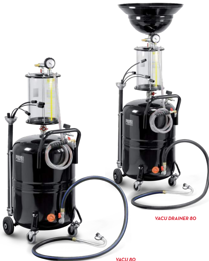
VACU DRAINER 80