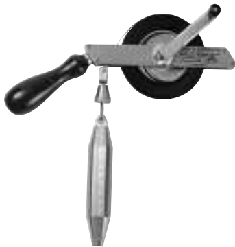
TAPES WITH FRAMES