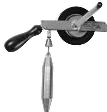
TAPES WITH FRAMES